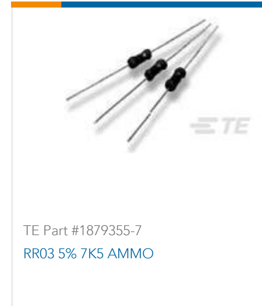
TE Part #1879355-7 RR03 5% 7K5 AMMO