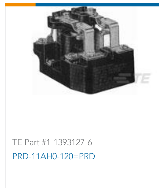
TE Part #1-1393127-6 PRD-11AH0-120=PRD