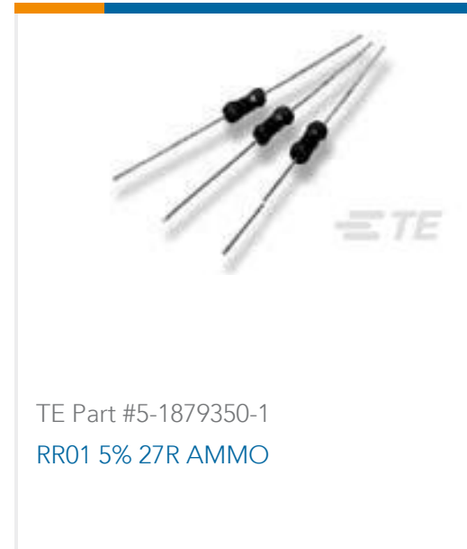
TE Part #5-1879350-1 RR01 5% 27R AMMO