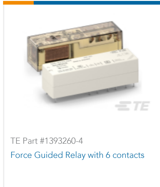
TE Part #1393260-4 Force Guided Relay with 6 contacts