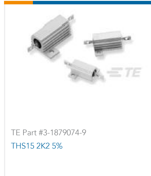
TE Part #3-1879074-9 THS15 2K2 5%