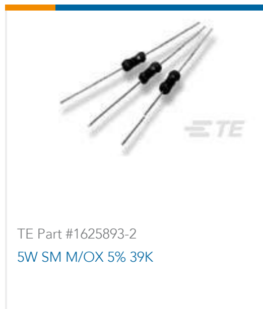
TE Part #1625893-2 5W SM M/OX 5% 39K