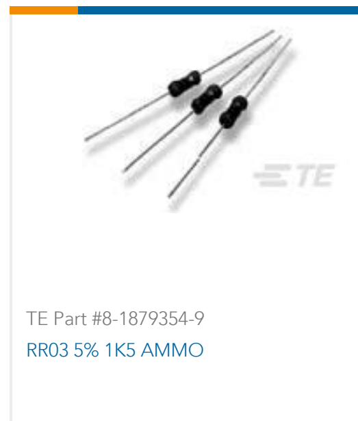
TE Part #8-1879354-9 RR03 5% 1K5 AMMO