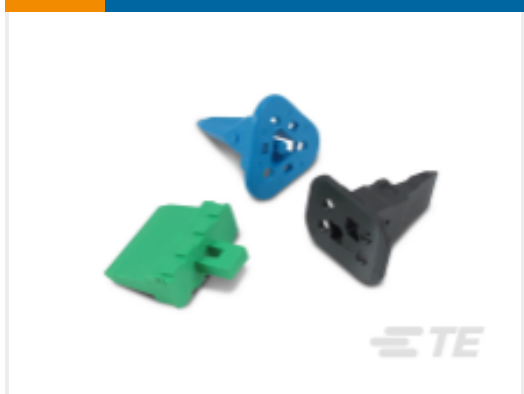
TE Part #W6P Wedgelocks: DEUTSCH DT