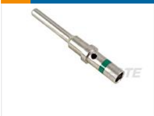
TE Part #0460-215-16141 PIN, SOLID, SIZE 16, 14AWG, NI