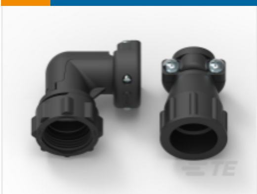
TE Part #206966-7 CPC Cable Clamps