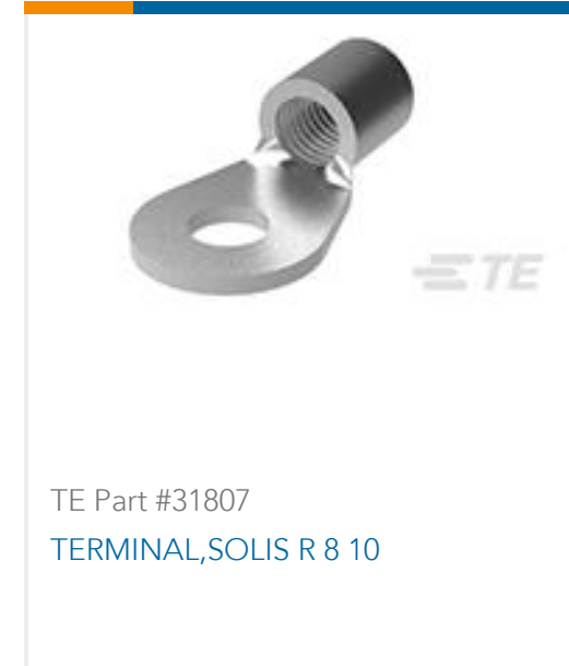
TE Part #31807 TERMINAL, SOLIS R 8 10