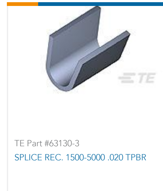
TE Part #63130-3 SPLICE REC. 1500-5000 .020 TPBR