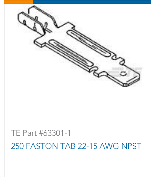
TE Part #63301-1 250 FASTON TAB 22-15 AWG NPST