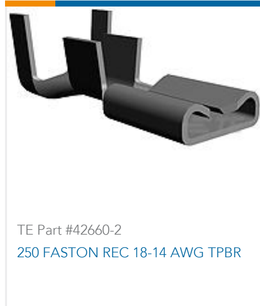
TE Part #42660-2 250 FASTON REC 18-14 AWG TPBR