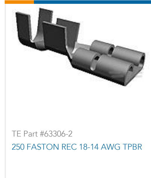
TE Part #63306-2 250 FASTON REC 18-14 AWG TPBR