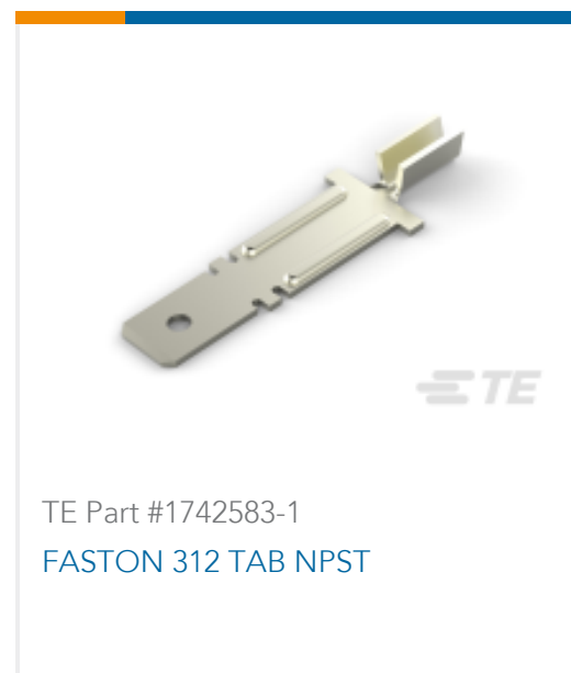
TE Part #1742583-1 FASTON 312 TAB NPST