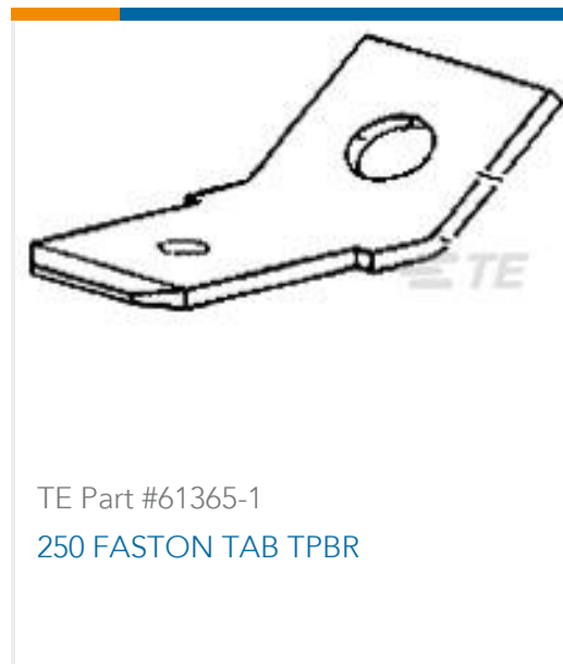
TE Part #61365-1 250 FASTON TAB TPBR