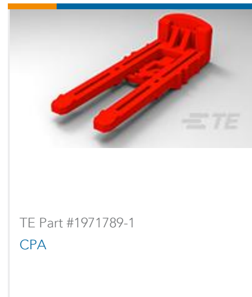
TE Part #1971789-1 CPA