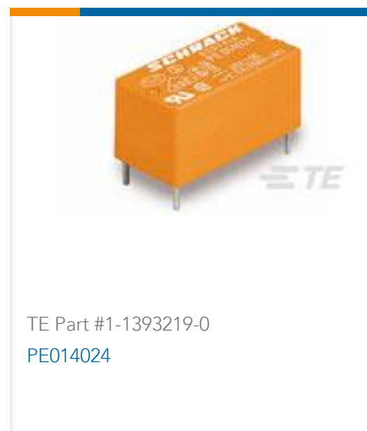
TE Part #1-1393219-0 PE014024