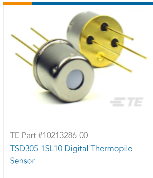
TE Part #10213286-00 TSD305-1SL10 Digital Thermopile Sensor