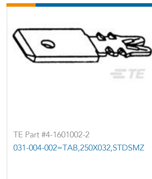
TE Part #4-1601002-2 031-004-002=TAB, 250X032, STDSMZ