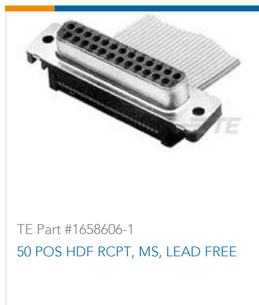
TE Part #1658606-1 50 POS HDF RCPT, MS, LEAD FREE