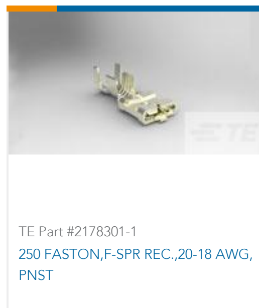
TE Part #2178301-1 250 FASTON, F-SPR REC., 20-18 AWG, PNST