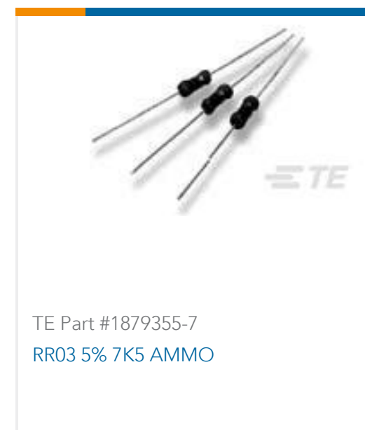
TE Part #1879355-7 RR03 5% 7K5 AMMO