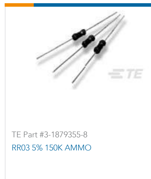
TE Part #3-1879355-8 RR03 5% 150K AMMO