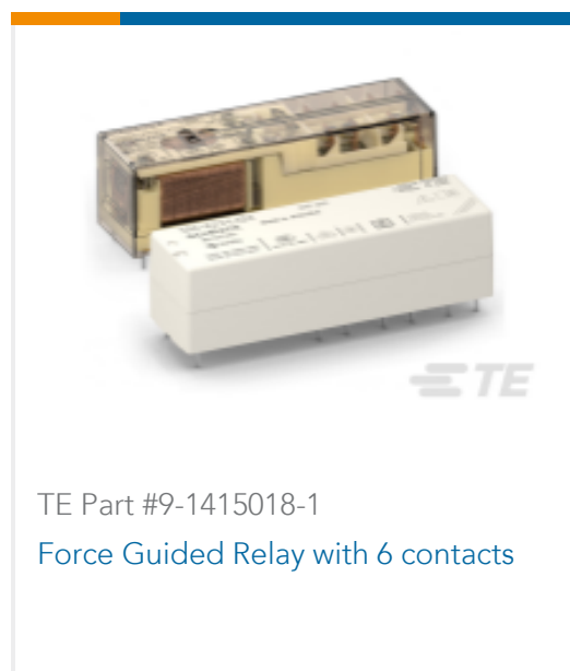
TE Part #9-1415018-1 Force Guided Relay with 6 contacts