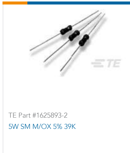
TE Part #1625893-2 5W SM M/OX 5% 39K