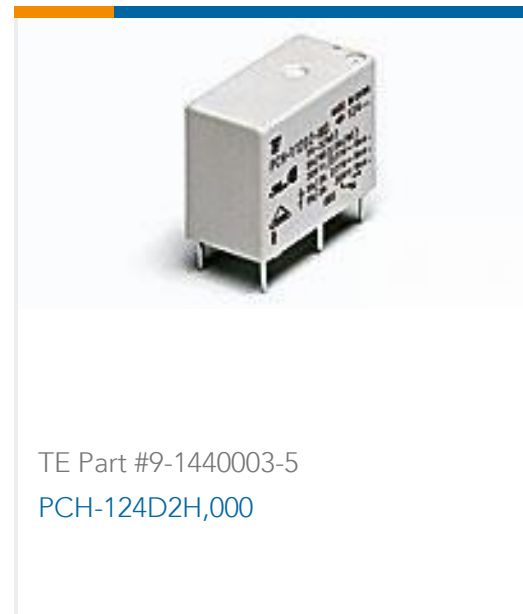
TE Part #9-1440003-5 PCH-124D2H,000