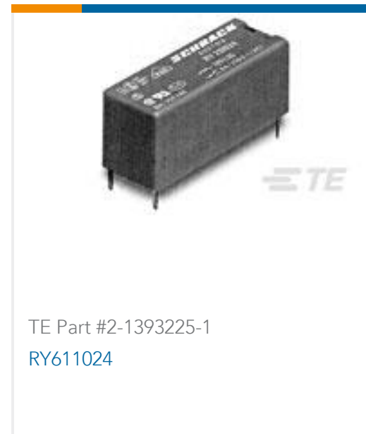
TE Part #2-1393225-1 RY611024