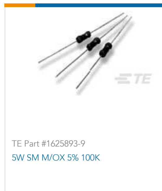
TE Part #1625893-9 5W SM M/OX 5% 100K