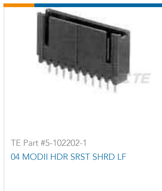
TE Part #5-102202-1 04 MODII HDR SRST SHRD LF