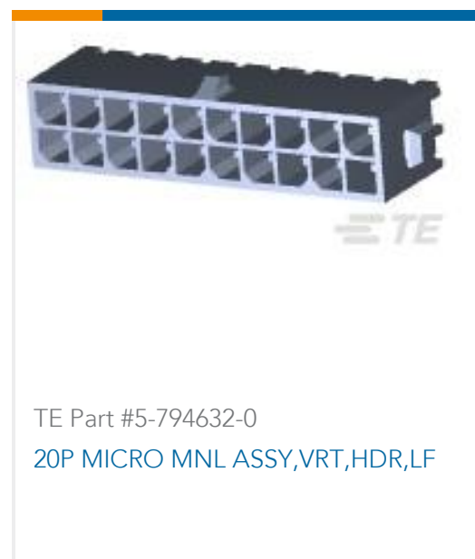
TE Part #5-794632-0 20P MICRO MNL ASSY,VRT,HDR,LF