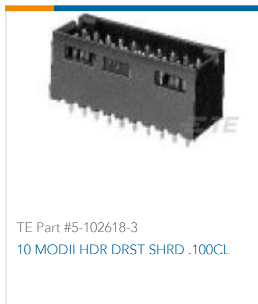
TE Part #5-102618-3 10 MODII HDR DRST SHRD .100CL