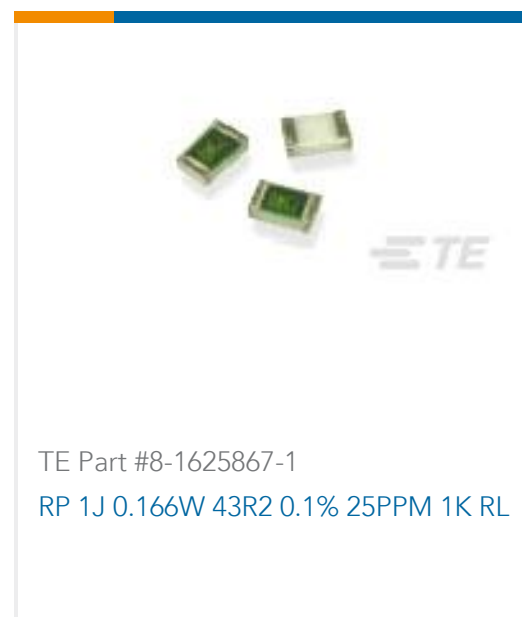
TE Part #8-1625867-1 RP 1J 0.166W 43R2 0.1% 25PPM 1K RL