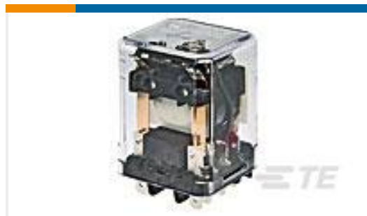
TE Part #1393114-5 KUEP-3D35-24=KU