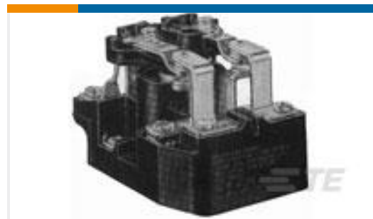
TE Part #1393127-9 PRD-11AG0-120=PRD