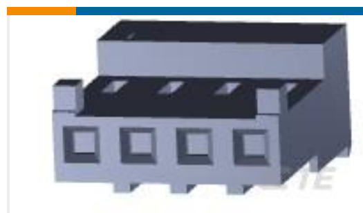
TE Part #3-644463-4 04P MTA156 CONN ASSY 22AWG RED