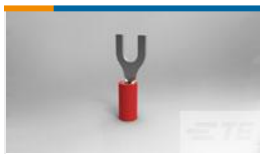
TE Part #2-32051-1 PIDG SPD 22-16COMM 22-18MIL 10