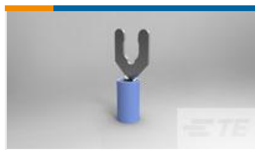
TE Part #52937-1 TERMINAL,PIDG SPR SPD 16-14 10