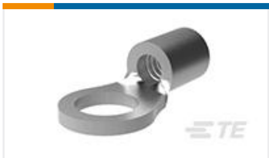
TE Part #33463 TERMINAL,SOLIS R 8 3/8