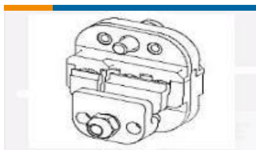
TE Part #2063030-1 SDE DIESET, RBY, UL