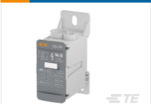
TE Part #1SNL312510R0000 DBL125