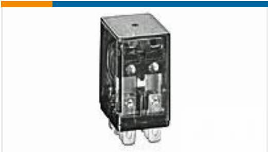
TE Part #5-1393144-4 K10P-11D15-110=K10/K20