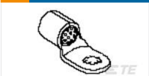
TE Part #50717-1 TERMINAL,COPALUM 4 1/4