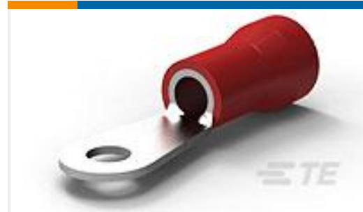
TE Part #52263 TERMINAL R PG 8 10