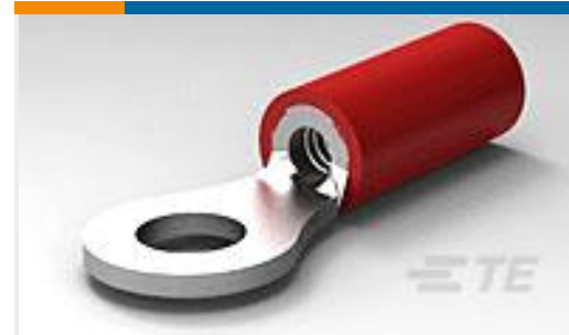
TE Part #32947 PG R 22-16 COMM 22-18 MIL 6