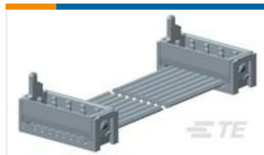
TE Part #1483352-3 MICRO-MATCH LEAD 08P 250MM