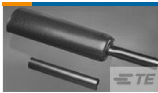
TE Part #C71645-000 RMW-10/3-1200/ADH-0