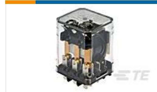
TE Part #3-1393117-0 KUP-11A55-24=KU