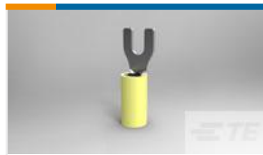
TE Part #8-35152-2 TERMINAL,PIDG SPD 12-10 8