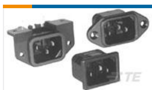
TE Part #1609133-4 6ESRMC2=F6989