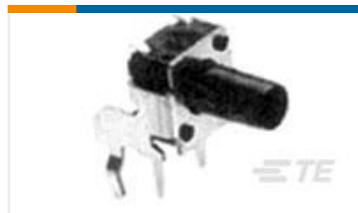
TE Part #1825027-2 FSMRA1JH04=R/A,TACT PB SW,160G