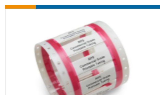
TE Part #8296870003 RPS Commercial Grade Sleeves