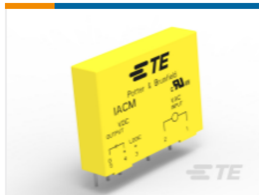
TE Part # 1393028-7 IACM-15 = SLIM PCB MONT,15VDC Logi-AC ip