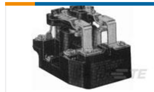
TE Part #7-1393131-9 PRDA-11AYA-120=PRD