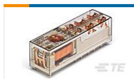
TE Part #9-1415018-1 SR6A4110 - V23050-A1110-A533