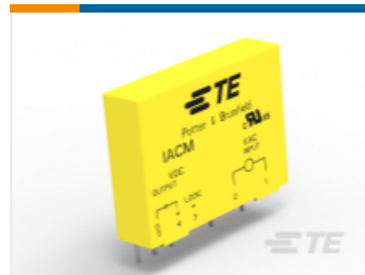
TE Part # 8-1393028-9 IACM-24 = SLIM PCB MONT,24VDC Logi-AC ip