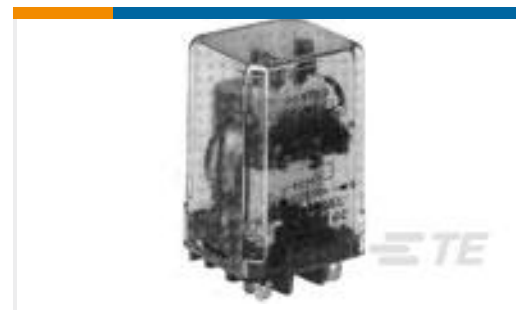
TE Part #2-1393115-7 KUL-11A15S-24=KU