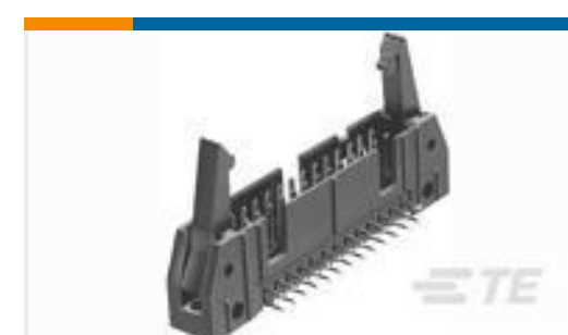
TE Part #5499141-6 A/L UNIV HDR 26P RA LG LAT