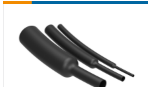
TE Part #3251936001 CGPT-R-3.2-0