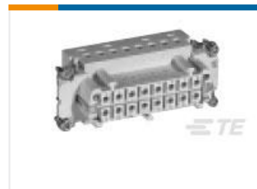
TE Part #1-1103639-1 HE.16.BU.S.B 1-16