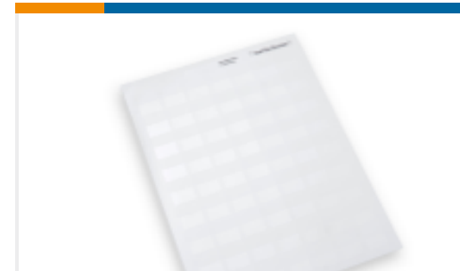
TE Part #9-1768016-7 CSL Self Laminating Polyester Labels