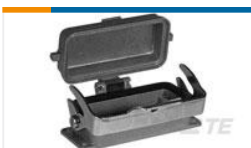
TE Part #1-1102305-2 HB.16.AGD-LB