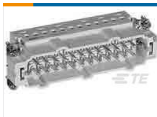
TE Part #1-1103640-8 HE24STI S-T.B12+6+6