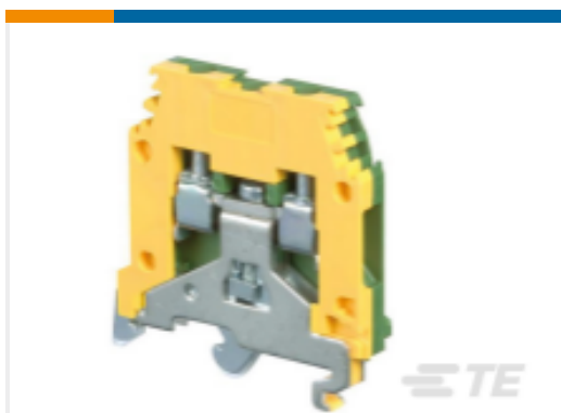
TE Part #1SNA165488R2700 MA2.5/5.P