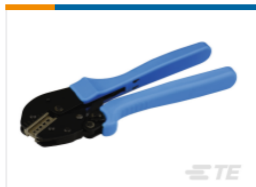
TE Part #T3100000001-000 CRIMPBOX-0.14/4.0