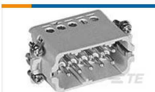
TE Part #1-1103416-1 HA.16.STI.S