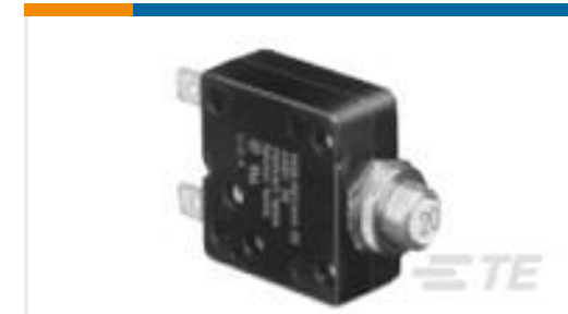
TE Part #1393249-7 W58-XB1A4A-10=W58