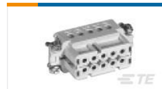
TE Part #1-1103415-1 HA.10.BU.S.B1-10