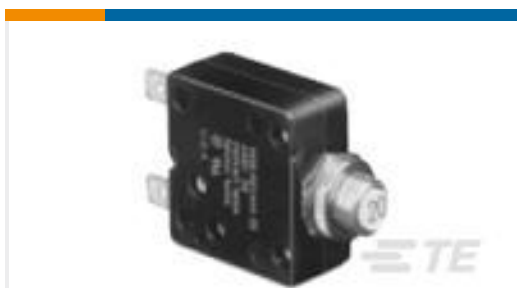
TE Part #1393249-8 W58-XB1A4A-12=W58