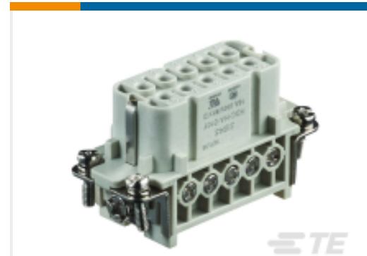
TE Part #T2010102201-000 HA-010-F