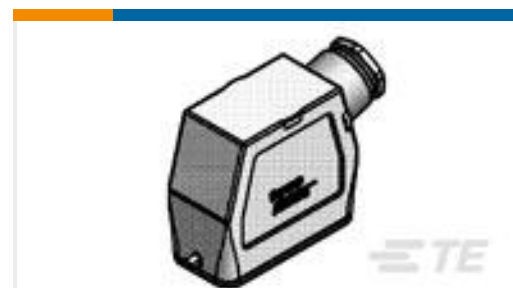
TE Part #1-1102115-7 HA.10.STS.1.16