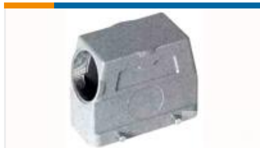
TE Part #1-1102567-6 HD.40.STS.1.29.G