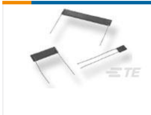
TE Part #1625960-8 HBA RE 33M 1% 100PPM