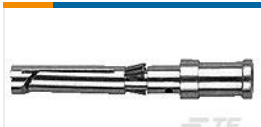
TE Part #5-1105051-1 HN.D-C-BU.AG.2.5