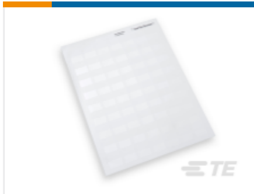
TE Part #9-1768016-7 CSL Self Laminating Polyester Labels