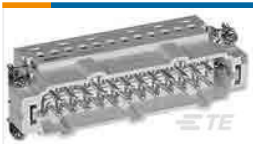
TE Part #1-1103640-8 HE24STI S-T.B12+6+6