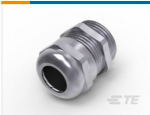
TE Part #T3609400102-000 DLX-40-M