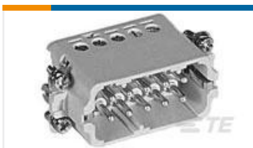
TE Part #1-1103414-1 HA.10.STI.S