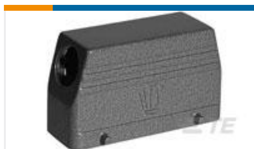
TE Part #1-1102319-6 HB.24.STS.1.29.G