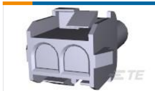
TE Part #1-480699-0 02P UMNL CAP HSG NATL