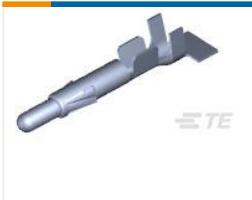
TE Part #350218-1 UMNL PIN 20-14 .0126PTPBR