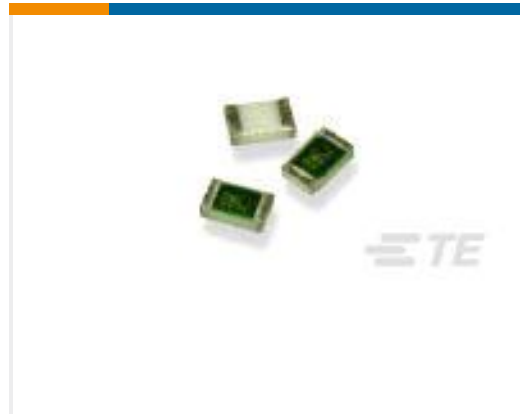
TE Part #3-1879337-8 CPF 0603 6K04 1% 50PPM 1K RL