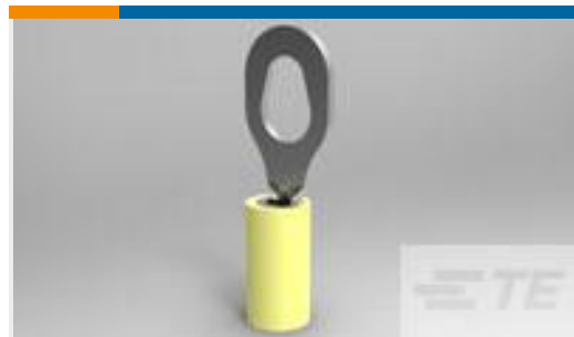
TE Part #54773-1 TERMINAL,PIDG R 12-10 6-8-10