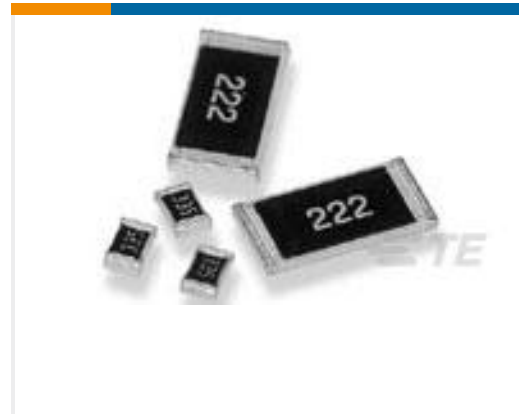
TE Part #2-1879502-8 CRGH2512 5% 180K 2W