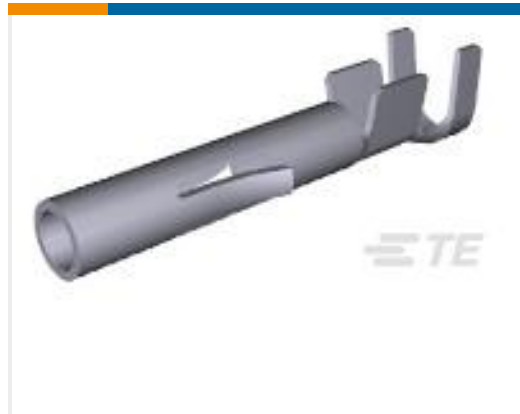
TE Part #350536-1 UMNL SOK 20-14 .0126 PTPBR