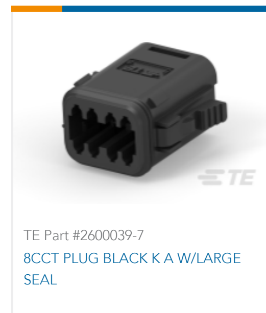
TE Part #2600039-7 8CCT PLUG BLACK K A W/LARGE SEAL