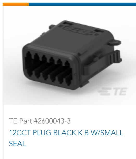
TE Part #2600043-3 12CCT PLUG BLACK K B W/SMALL SEAL