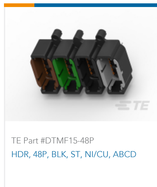
TE Part #DTMF15-48P HDR, 48P, BLK, ST, NI/CU, ABCD