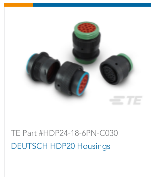
TE Part #HDP24-18-6PN-C030 DEUTSCH HDP20 Housings