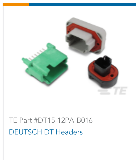
TE Part #DT15-12PA-B016 DEUTSCH DT Headers