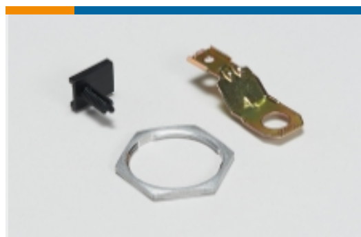
Other Automotive Connector Accessories(11)