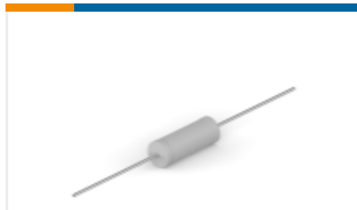
TE Part #9-2176412-8 5W XSM M/OX 5% 56K