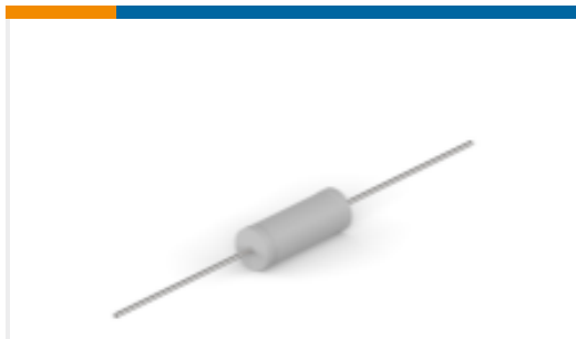
TE Part #9-2176412-6 5W XSM M/OX 5% 47K