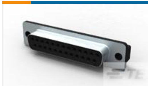
TE Part #5745967-2 25 RCPT SP/FMS STD