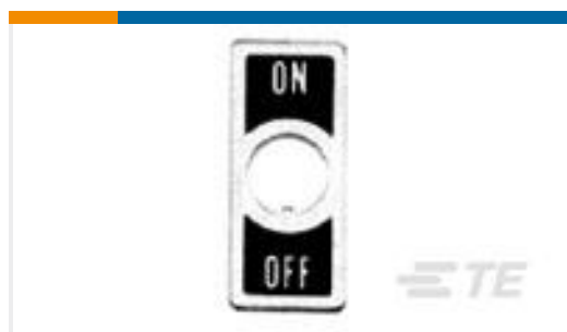
TE Part #2-1437628-6 SPA42=SW PLATE (ON-OFF) 1/4" D