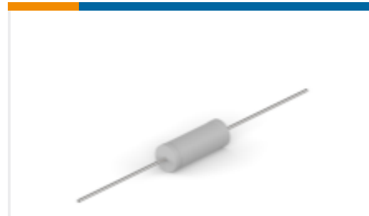
TE Part #9-2176412-0 5W XSM M/OX 5% 27K