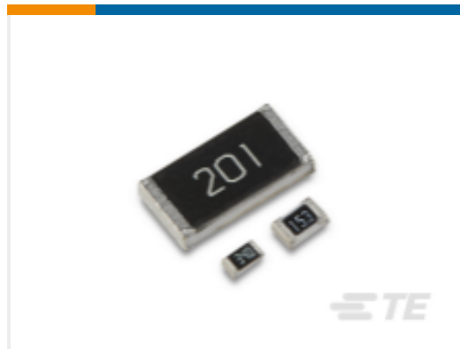
TE Part #2176328-3 CRGP 1206 15R 1%