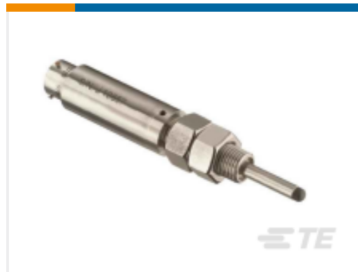
TE Part #02351008-000 GA-HD GCD-SE-500 ASSY