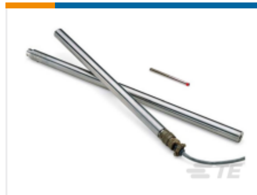
TE Part #04560950-000 MTG BLOCK ASSY E-LIN HCA 7LVTZ