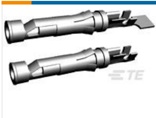
TE Part #1-66101-9 III+ SKT,18-16,TIN ,LP