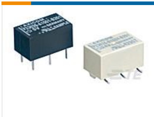
TE Part #2-1393774-0 V23026C1051B201