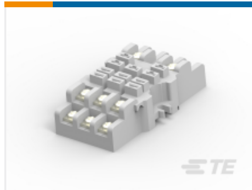
TE Part #1393143-5 27E121=SOCKET,KUP,11,SCW,PLE