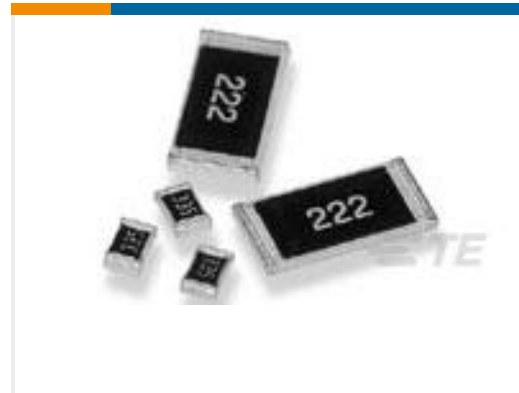
TE Part #1623231-1 CRG0805 1% 470K