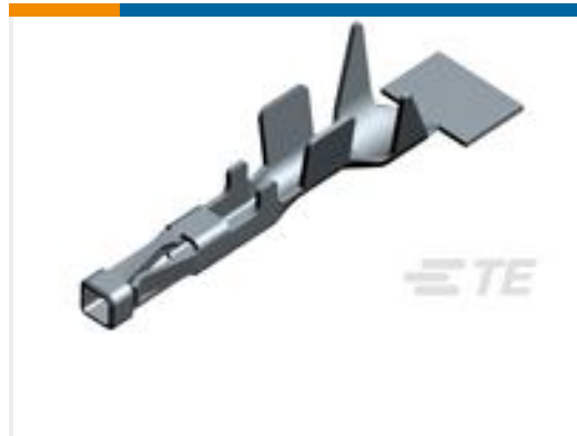
TE Part #2008625-1 Socket Micro MNL, TIN 22-18 AW