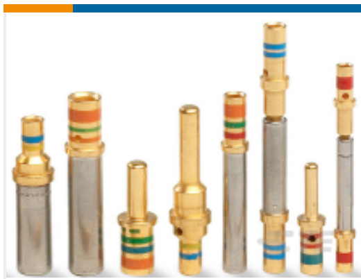
TE Part # 0007-008-100L CONT SOC ASSY