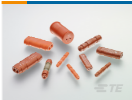
TE Part #CTL-20-513 JUNCTION ASSY