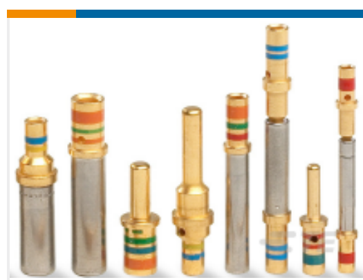
TE Part #0007-008-100L CONT SOC ASSY