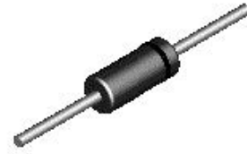
AXIAL LEAD (DO-35) CASE 017AG

Sourced from Process 1M. See MMBD1501 –1505 for characteristics.