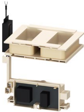
Magnet coil with switch-on electronics for contactor 3TF6844-.C..., 380...460 V AC 50/60 Hz