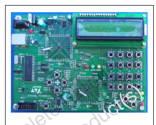
STEVAL C 5001V1

The objective of this STEVAL-TCS001V1 demonstration board is to display to the user the features and capabilities of the port expander chip STMPE2401 using a windows-based host software application and one of several USB lowspeed microcontrollers ST72F63B from ST acting as a control device. In this demonstration board, the ST72F63B microcontroller acts as the I2C master and controls two STMPE2401 devices functioning as I2C slaves. The two STMPE2401 devices are used to interface LCD, normal keypad, rotator controller, dedicated keys and 6 PWM outputs. All these interfaces are controlled by just using I2C communication, between master and slave devices. All events like dedicated key press (four direction kays), kaypad key press (4 x 4 keypad), rotain direction, power mode etc. are captured and displayed in LCD screen and in the scan window of PC GUI. For interfacing with the PC Gui, the application layer is built above the USE core library that makes all the hardware control of the USB interface transparent for the developers. The PC GUI supports various power saving modes of port expander and wake up feature to get back to default operational mode. In addition the board has the provision for an alternate I2C path for external control. The board also has ICC connectors to re-program the ST7 microcontroller Flash memory.