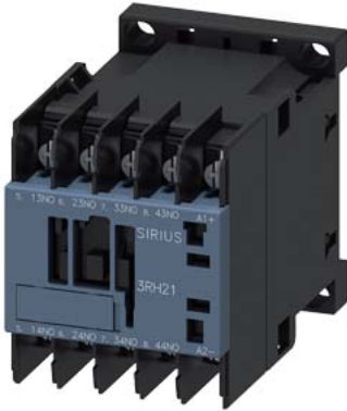
Contactor relay, 4 NO, 48 V DC, Size S00, ring cable lug connection