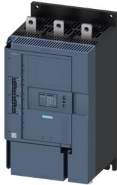
SIRIUS soft starter 200-480 V 250 A, 24 V AC/DC spring-type terminals Analog output