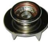
CS1010 - Female Socket