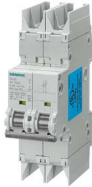
Circuit breaker 10kA, 2-pole, C, 3 A according to UL 489-480Y/277V