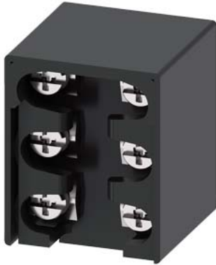
Contact block for position switch 3SE51/52 1 NO/2 NC quick action contact