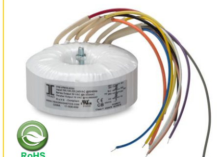
VEU Photo for illustration only

460 Harley Knox Blvd. Perris, California 92571