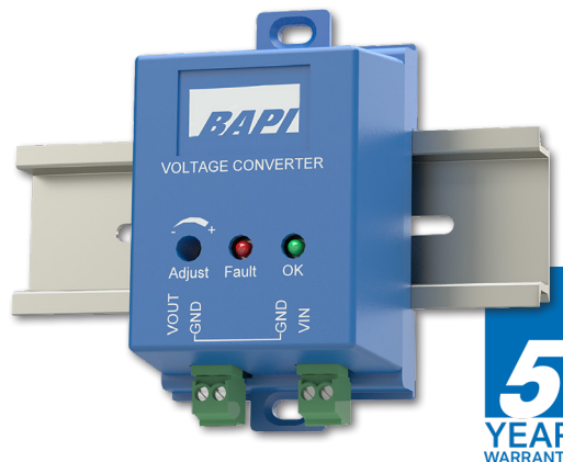
VC350A EZ mounted on DIN Rail

Although most BAPI room units can run on 24 VAC power, converting to DC power eliminates the AC power "noise" which can affect the room sensor readings. BAPI's tests show that fluctuating and inaccurate signal levels are possible when AC power wiring is present in the same cable as the signal lines. All fixed outputs of 5, 10, 12 or 15 VDC are adjustable \pm 10\% . The adjustable model has an output of 5 to 24 VDC.