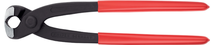
10 98 I220

Suitable for universal use due to the additional side jaw