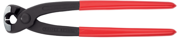
10 99 I220