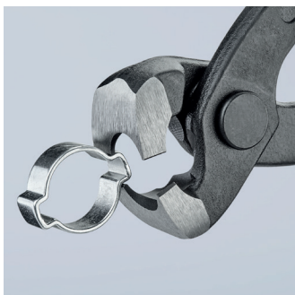
Using the front press jaw