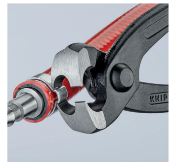
Sealing the fluid hose on the connecting piece using the side press jaw