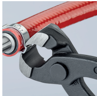
Sealing the fluid hose on the connecting piece