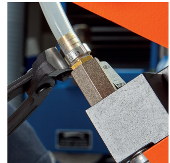
Sealing the hose connection on central lubrication