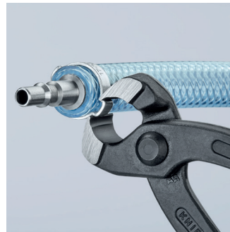
Sealing the pneumatic hose on the quick action coupling