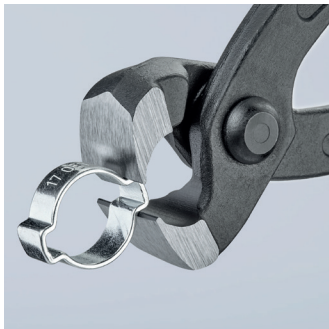
Front press jaw