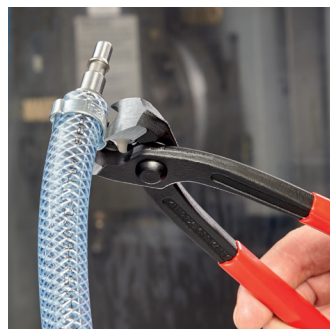
Sealing the pneumatic hose on the quick action coupling using the side press jaw