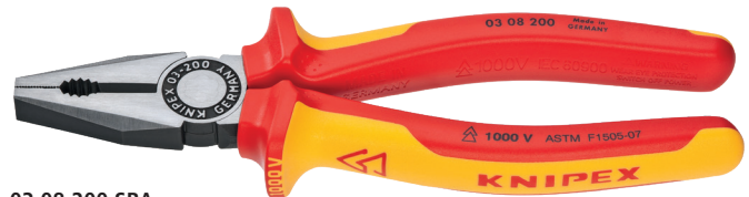
03 08 200 SBA