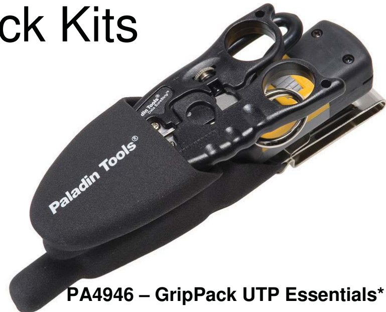
PA4946 – GripPack UTP Essentials*

Same features as other GripPacks; securely holds tools in place, swiveling quick release belt clip..