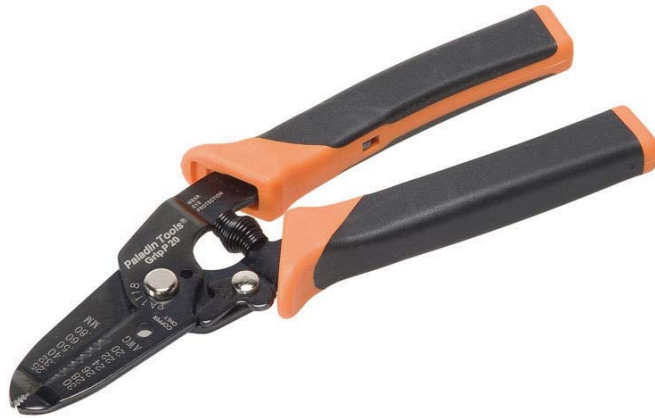
PA1117 Wire Stripper 22-10 AWG* PA1118 Wire Stripper 30-20 AWG * PA1123 Wire Stripper Bundle *

Upgraded existing products with dual-material ProGrips for improved comfort and control