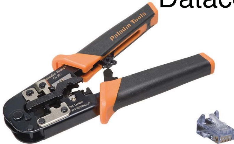
PA1561 – All-in-One UTP Snagless Crimper

Professional, fully ratcheting UTP crimper for standard and ‘snagless” RJ45 connectors. Also crimps RJ11/22 and RJ 22 WE/SS style plugs.