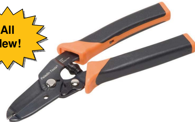
PA1181 Flat Cable Cutter Professional cutting tool for electronic and computer applications.

Cut flat satin cables easily and quickly Gripping pliers at tip of the tool ProGrips for improved comfort and control