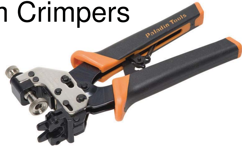
PA1559 – SealTite ProM Coax Crimper

Professional, fully ratcheting coax compression crimper for standard and “mini” CATV-F, RCA and BNC connectors for RG59, RG6, RG6Q and RG58 cables. Also accommodates right-angle connectors. Dual-material grips for improved comfort and control.