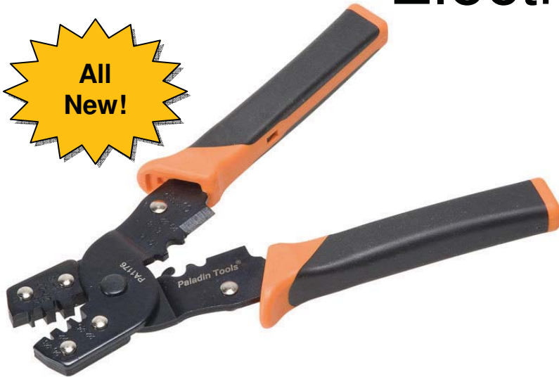
PA1176 – Electrical Terminal Crimper