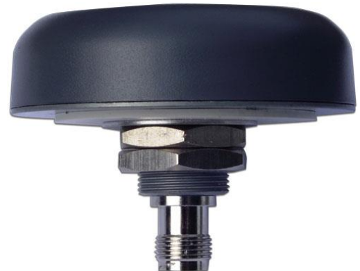
TW3040/TW3042 Dimensions (mm) Flat Radome shown. Conical Radome also available