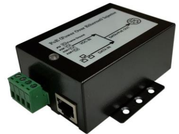
TP-DCDC-1248M (Metal Enclosure)