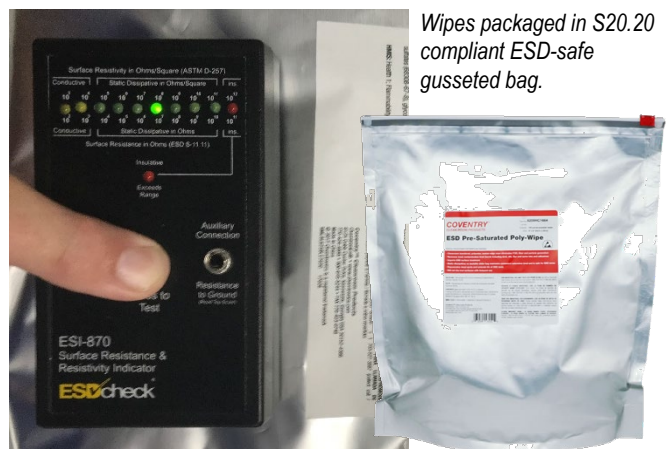
Wipes packaged in S20.20 compliant ESD-safe gusseted bag.