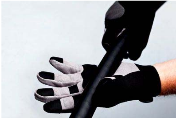
Increase in holding power, while using less force

Constructed with thousands of micro-replicated gripping fingers, 3M™ Gripping Material TB531 provides a lighter, yet tighter grip for maximum hold with minimum effort. Designed to enhance grip and reduce slippage, this product is a firm, but soft, and durable gripping material. Backed with a pressure sensitive acrylic adhesive, this gripping material can bond to a variety of surfaces.