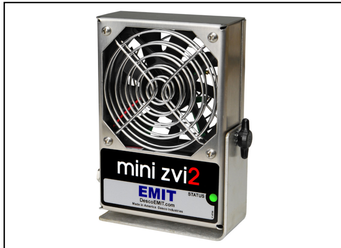
Figure 1. EMIT 50642 Mini Zero Volt Ionizer 2