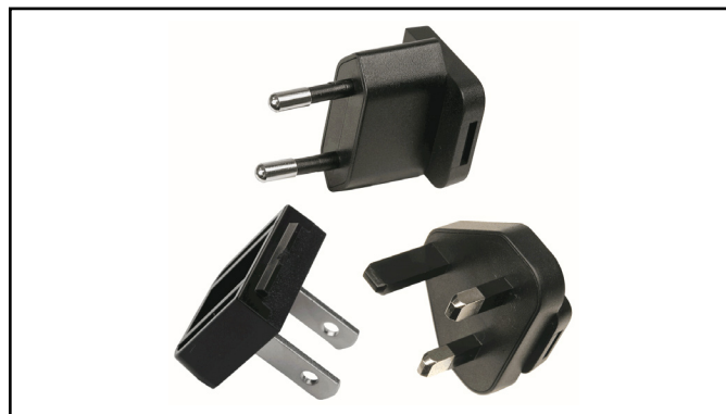
Figure 2. Interchangeable power adapter plugs included with the Mini Zero Volt Ionizer 2