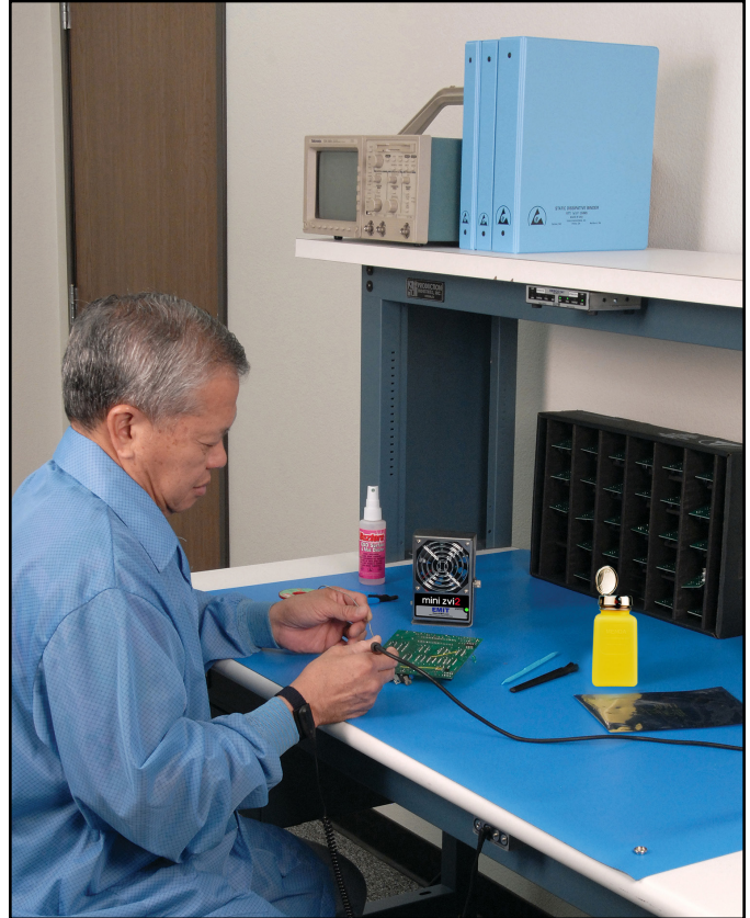
Figure 4. Using the Mini Zero Volt Ionizer 2 at a workstation.