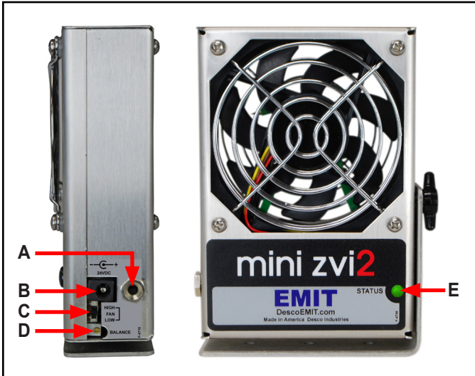
Figure 3. Mini Zero Volt Ionizer 2 features and components

A. Ground Jack: Insert the banana plug end of the included ground cord to this jack. Connect the ring terminal end of the cord to equipment ground.