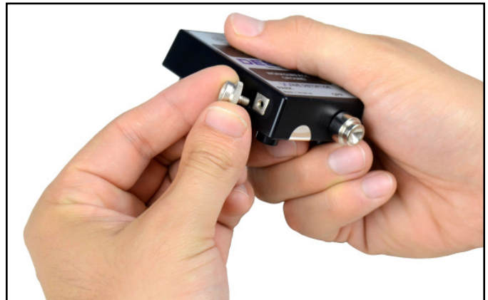
Figure 7. Changing the park snap on the 19243 Mini Monitor

The 19243 Mini Monitor includes an interchangeable 10mm park snap and 10mm banana jack adapter for operators who use wrist cords with 10mm terminations. Use the park snaps' knurled rims to unscrew the 4mm park snap from the monitor and install the 10mm park snap to the monitor. Plug the 10mm operator jack adapter into the monitor's operator jack.