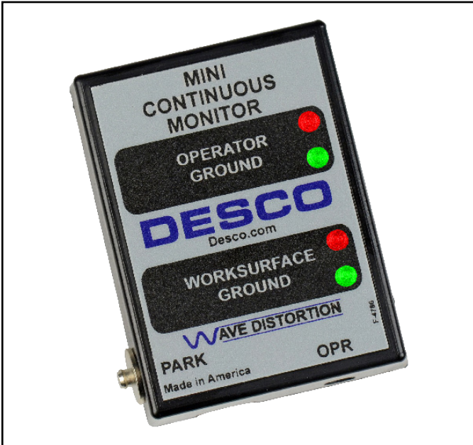
Figure 1. Desco Mini Monitor