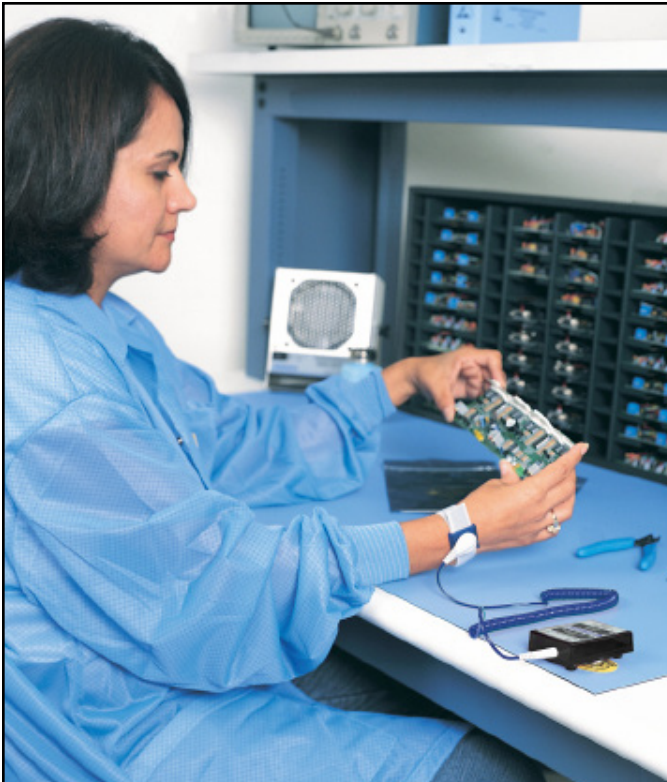
Figure 8. Using the Mini Monitor