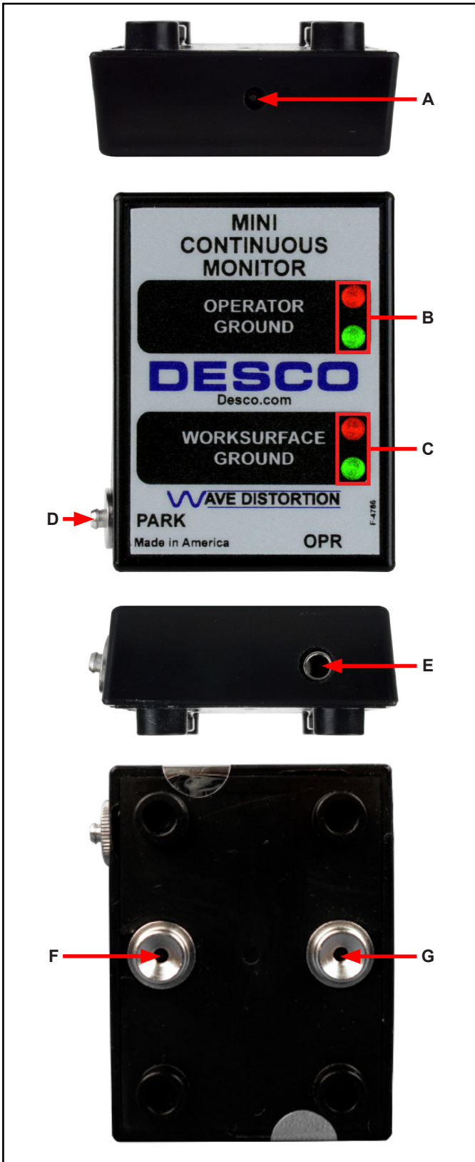
Figure 4. Mini Monitor features and components

A. Power Jack: Connect the included 24VDC power adapter here.