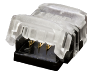
TAPE-TO-WIRE GRIPPER CONNECTOR