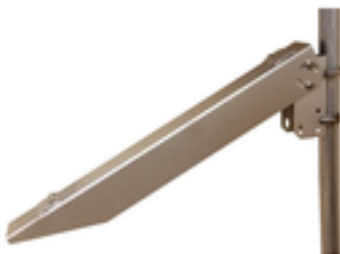
35W Solar Mount

Batteries are an Advance Glass Matt (AGM) type which have good all temperature deep discharge performance.