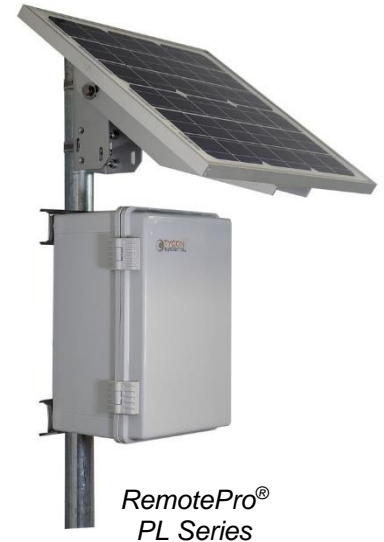
RemotePro® PL Series