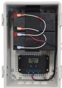
20A PWM Controller Inside