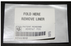
Remove label from liner