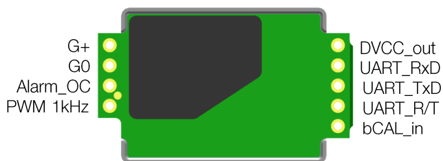
Figure 3. Pin assignment