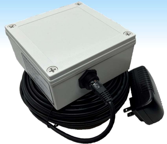
OPS8243 Traffic Monitor