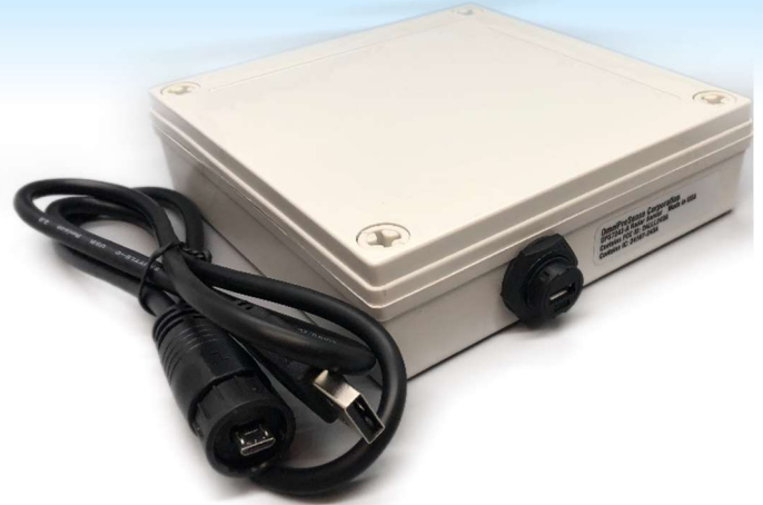
OPS7242 Radar Sensor