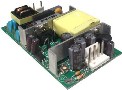
2.0"W x 3.5"L x 0.8"H