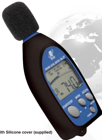
View with Silicone cover (supplied)