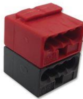
Figure 3 – KNX connector

The power supply is connected to connector J4 of the DUT. This connection can be done using a cable with official KNX connectors (Wago 243-211, farnell: 4016014).