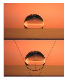
2.0% polymer on glass Water contact angle: 113.3°