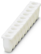
Insulating sleeve, color: white

https://www.phoenixcontact.com/us/products/3002843