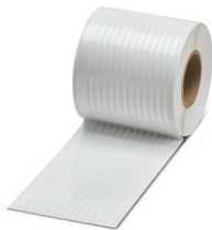
Marker strip, Roll, white, unlabeled, can be labeled with: THERMOMARK E.300 (D)/600 (D), THERMOMARK ROLL 2.0, THERMOMARK ROLL, THERMOMARK ROLL X1, THERMOMARK ROLLMASTER 300/600, THERMOMARK X1.2, mounting type: adhesive, lettering field size: continuous x 3.8 mm

https://www.phoenixcontact.com/us/products/0801837