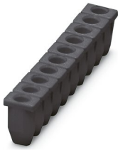
Insulating sleeve, color: black

https://www.phoenixcontact.com/us/products/3002869